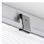
Stainless steel clips