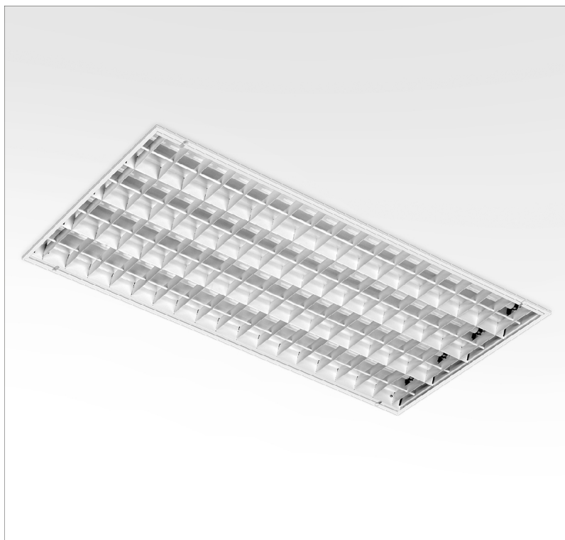
ELG - White powder coated "V" shape louvre with steel rods

Surface Finish: Powder coated in white matt (RAL9016).