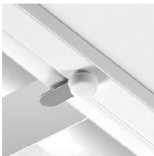
Proteção adicional para refletor

We reserve the right to make technical changes without prior notice. Electrical/Optical data are subjected to a tolerance of +/-10%.