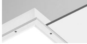
THE, CHE and LNE IP (Pull up)