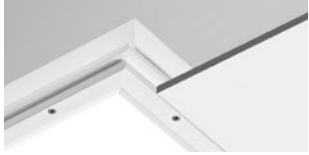
AVT LED, AVT and AVP (Lay in)