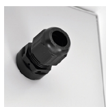
Plastic cable gland