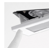
Easy to change lamps