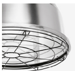
Grelha de proteção como opção