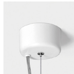
Ceiling rose detail