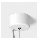
Ceiling rose detail