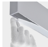
End caps without visible screws