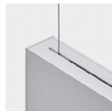
Clip-in diffuser system