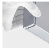
End caps without visible screws