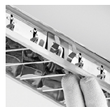
Clip-in aluminium louvre