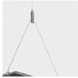
Suspension Type "Y"