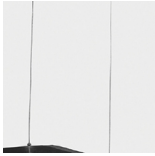
Suspension Type "I"