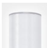
Profile end caps