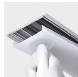
Clip-in diffuser system