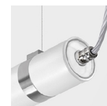
Metal cable gland standard for DSI/DALI versions