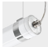
Metal cable gland standard for DALI versions

Example code for order: 904P.026.1G.F4 (HF) + 3000 + 915200 + 910200 + K1 (OPTIONS).