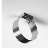
Basic stainless steel fixing holder