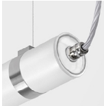
Metal cable gland standard for DS/DALI versions