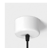
Ceiling rose detail

Example code for order: 90231.L101.E (ORDER CODE) + W (COLOUR/FINISH) + 5700 (OPTIONS)